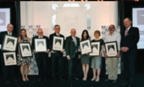
2015 Excellence in Business Award Winners