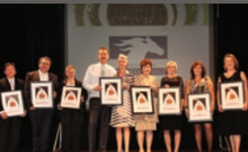
2014 Excellence in Business Award Winners

For more information about the Whitehorse Excellence in Business Awards, please contact the Whitehorse Business Group on 9275 6910 or via email to info@whitehorsebusinessgroup.com.au