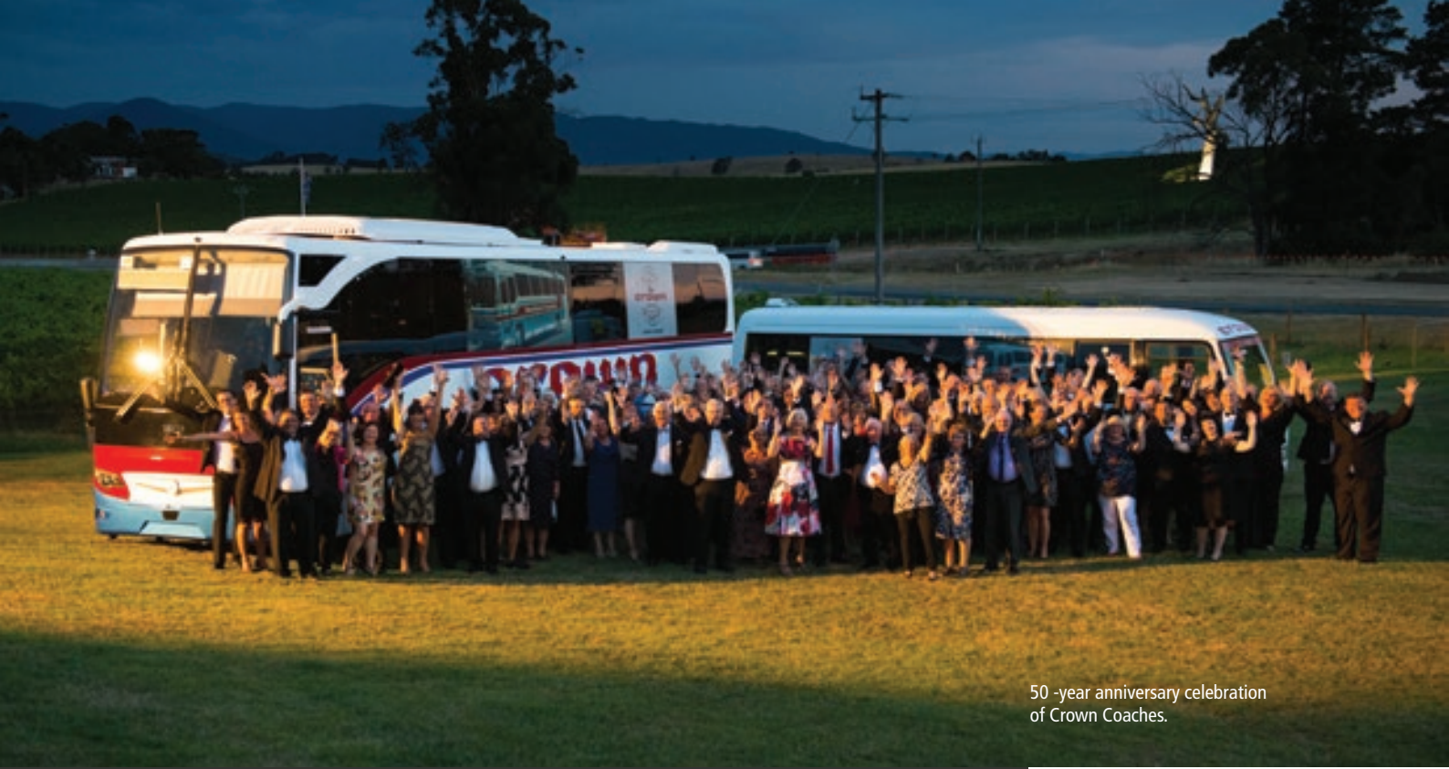
50-year anniversary celebration of Crown Coaches.