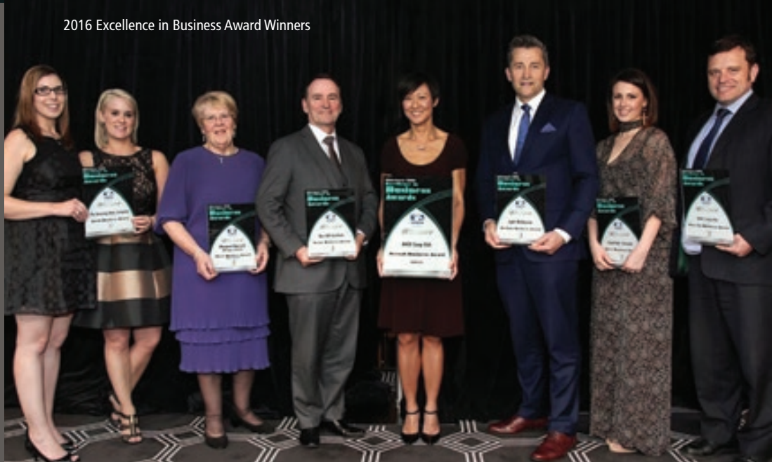
2016 Excellence in Business Award Winners